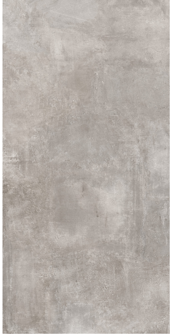
163 x 324 cm (64.17" x 127.56") Matte FD.PL.HOO.64x128.MT

All items shown in this document are part of Olympia's stocking program. For special orders, please contact your Olympia Tile Sales Representative.