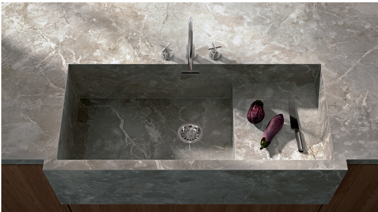
INFINITO - FIOR DI BOSCO (Grey)